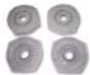
Product Model: Aluminum Machining

Product Name: NON-DRIVE SIDE END BELL -245