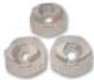
Product Model: Aluminum Machining

Aluminum Machining (We can Provided OEM service)